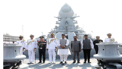
Defence Minister Rajnath Singh (fifth from left) with Goa Governor PS Sreedharan Pillai, Goa CM Dr Pramod Sawant and officers on board INS Mormugao.

In his address, Singh described INS Mormugao as one of the most powerful indigenously-built warships which