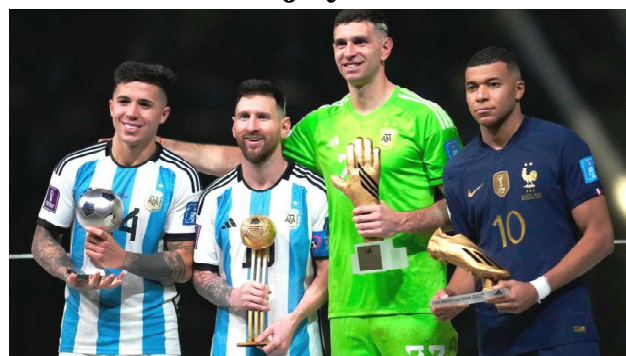
(L-R) Argentina's Enzo Fernandez holds the Best Young Player award, Argentina's Lionel Messi holds the Golden Ball award, Argentina's Emiliano Martinez holds the Golden Glove award and France's Kylian Mbappe holds the Golden Boot award.

"Finally, we are champions again," the businessman